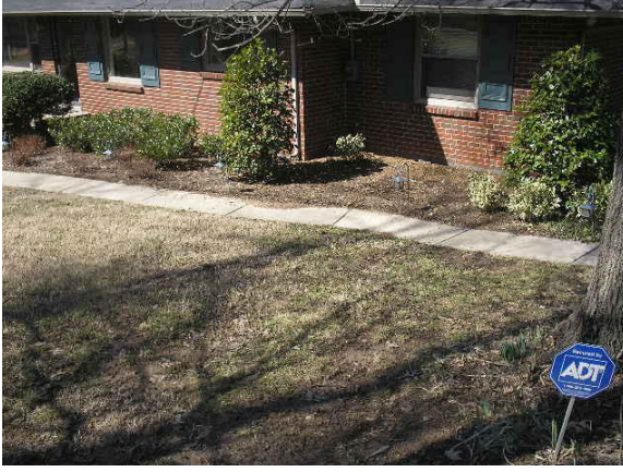
10. It is important that roof and surface water drain away from the foundation to properly